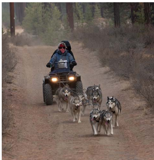
The brown eyed lead dog in the photos is Snosecrets Parker CD RE BN TKN CGC