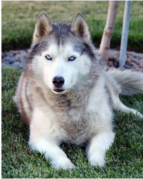
"Reiley" 5/30/04 - 8/19/17