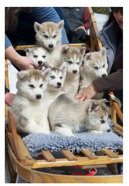
"Without my dog my wallet would be full my house would be clean but my heart would be empty."