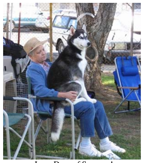
Lazy Days of Summer!