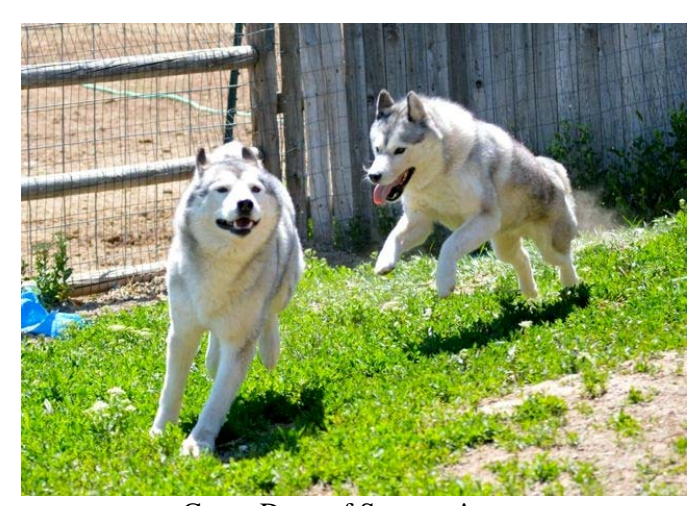
Crazy Days of Summer!

SELECT: GCh. Ch. Huskavarna's Cowgirls N' Angels P Marcy