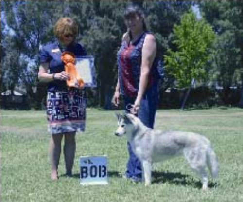
Best of Breed Adult Pachodi's Insurgent of Arcticgrace