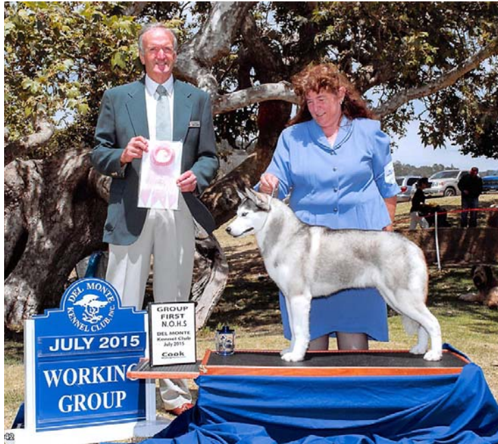
GCh. Ch. Serenade's Winter Melody

After finishing in 2014, with very limited showing, Piper picked up 8 pts towards her Grand Championship. In March of 2015, with Selena out on hiatus, I entered Piper under the Judge that had finished her championship. Thinking just to support the judge, I only entered her the one day of the 4 day weekend, Piper went Best of Breed and picked up a 5 pt major towards her Grand Championship!!! Hmm, guess it was time to get a bit more serious about finishing her Grand. So again with limited showing, Piper went on to win Best of Breed the following month for a 4pt major, a 4pt major select at Woofstock in June and finished her Grand Championship in July at Del Monte KC also going Best of Breed Owner Handler and on to an Owner Handler Group One!!