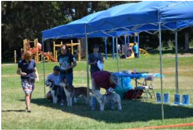
Best Puppy Competition