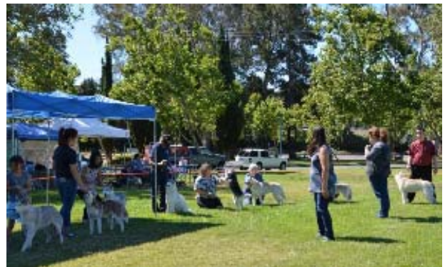
Handling Workshop Continues