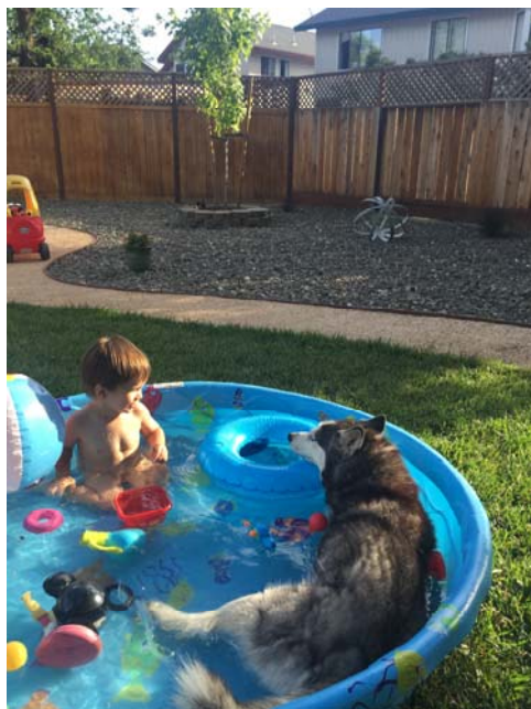
How to Stay Cool During the Heat of Summer

In This Issue: Match Report, Match Photos, Awards, Brags, Show Results