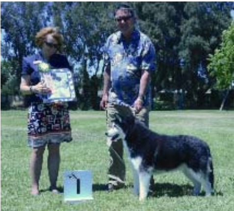
Best in Altered Classes Kochevoey's Flight Plan "Pilot"