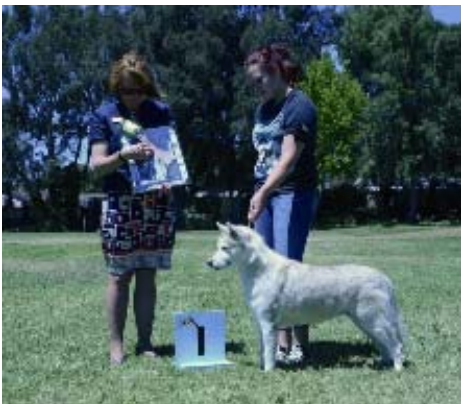
Best Veteran Nanook's Firestorm of Wolf