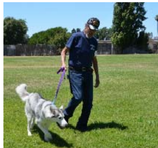
Parade of Rescue