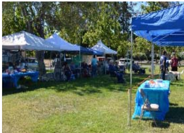
Enjoying the beautiful match day