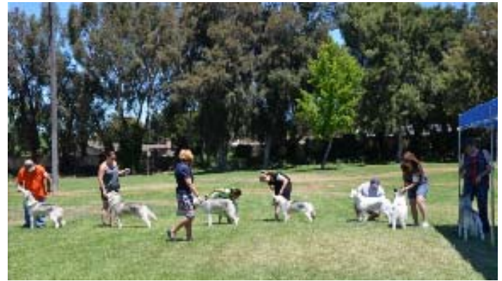
Best Adult Competition