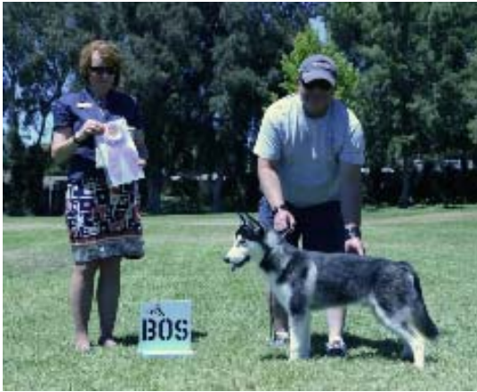
Best of Opposite Sex Puppy