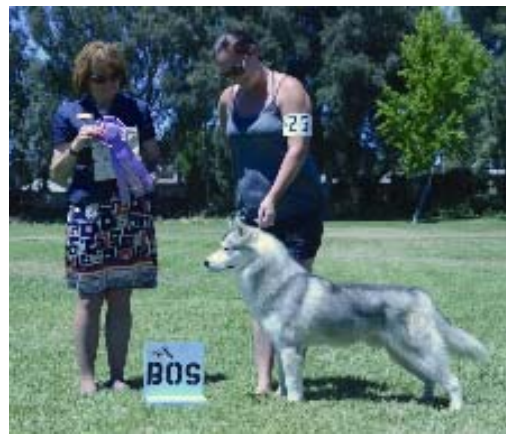
Best of Opposite Sex Adult