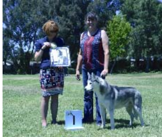
Best Sled Dog Articgrace's Buddha Of Jedeye