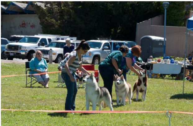
Veteran Dog Class