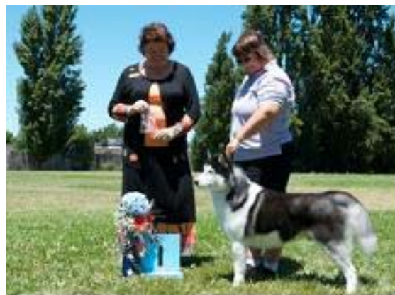
First Place Neutered Dog