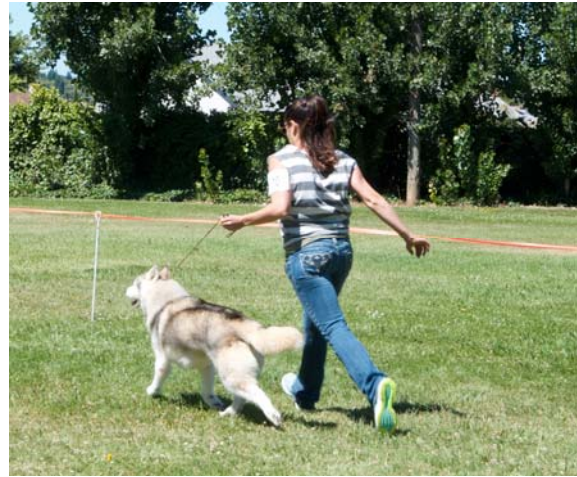
Veteran Dog Class