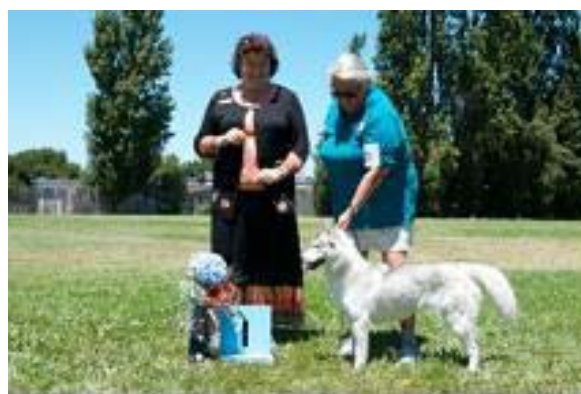
First Place 12-18 Month Bitch