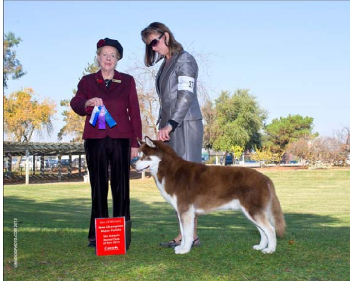
CH. Kochevoey's Jet Afterburner

Burney had minored out at the Bonanza Kennel Club show in October 2010. At the request of NCSHC members we entered him in the benched 2011 Golden Gate show. With his unusual color and markings, he always was a crowd favorite. At the Golden Gate Show Burn was picked as Best of Breed over four GCH specials, giving him a few more minor points. We were ecstatic over this win.