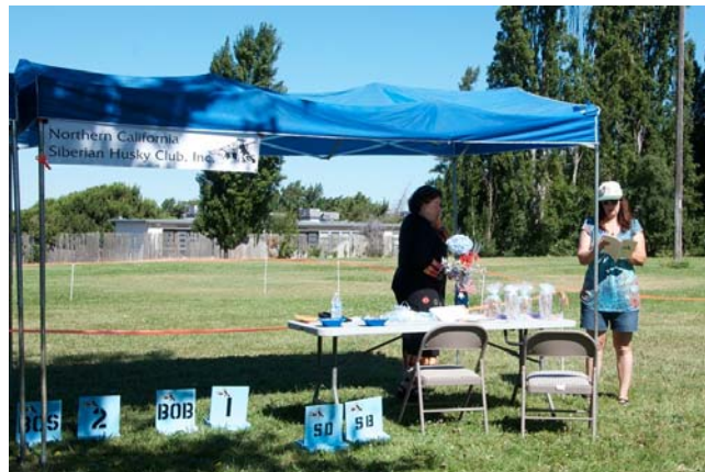
Ready to get the day started!