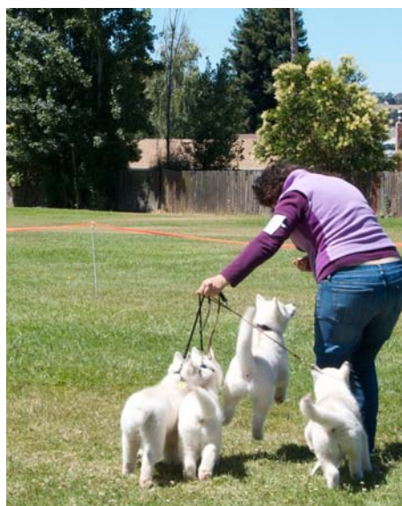
Team Class or Wrangling Puppies?