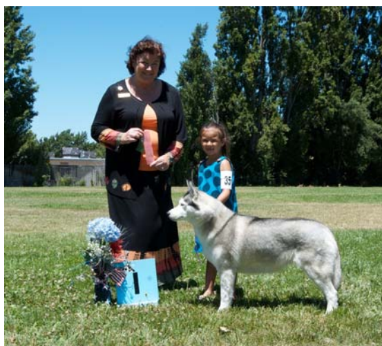
First Place Veteran Bitch