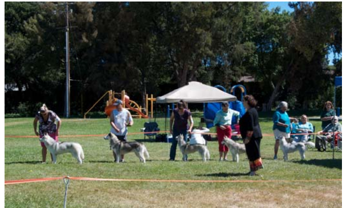
Best Adult in Match Competition