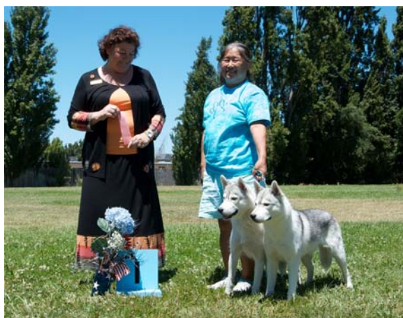
First Place Brace