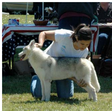
6-9 Month Puppy Bitch

SELECT: GCh. Kieran's De Wolf Of Shiloh E&BJ Stein