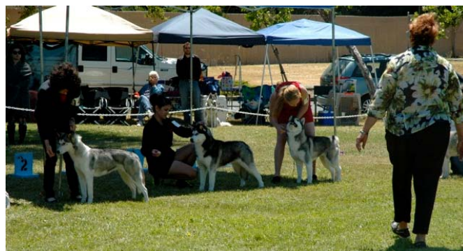
Open Bitch Class

SELECT: GCh Topaz Silver Lining A Aguirre, C French