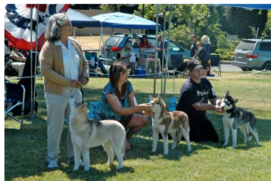
4-6 Month Puppy Dog Class