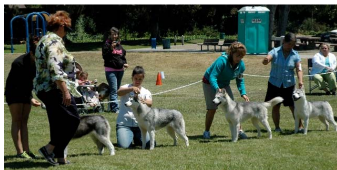
Open Bitch Class Placements