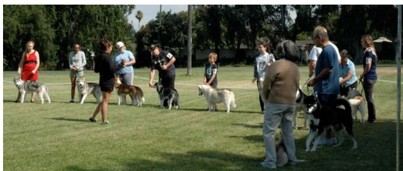
Handling Clinic 2