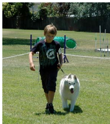
The Next Generation

SELECT: GCh. Poli's Forgetaboutit F&M Polimeni