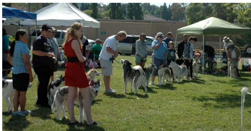
Handling Clinic 3