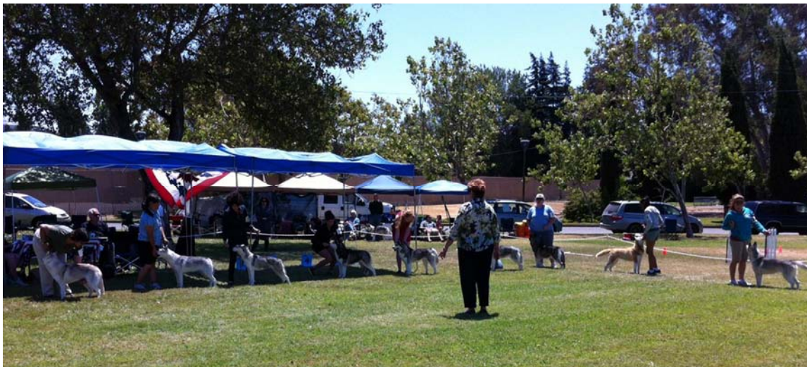
Open Bitch Class

In This Issue: Open Show Report, Open Show Photos, Awards