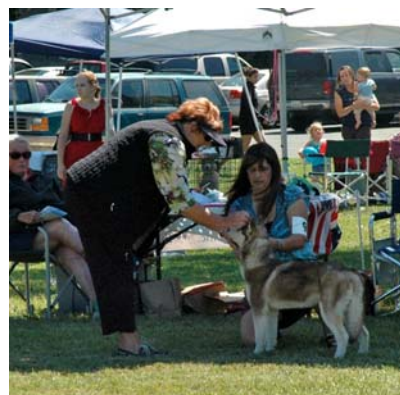
4-6 Month Puppy Dog 2