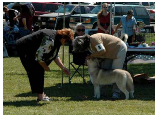
4-6 Month Puppy Dog