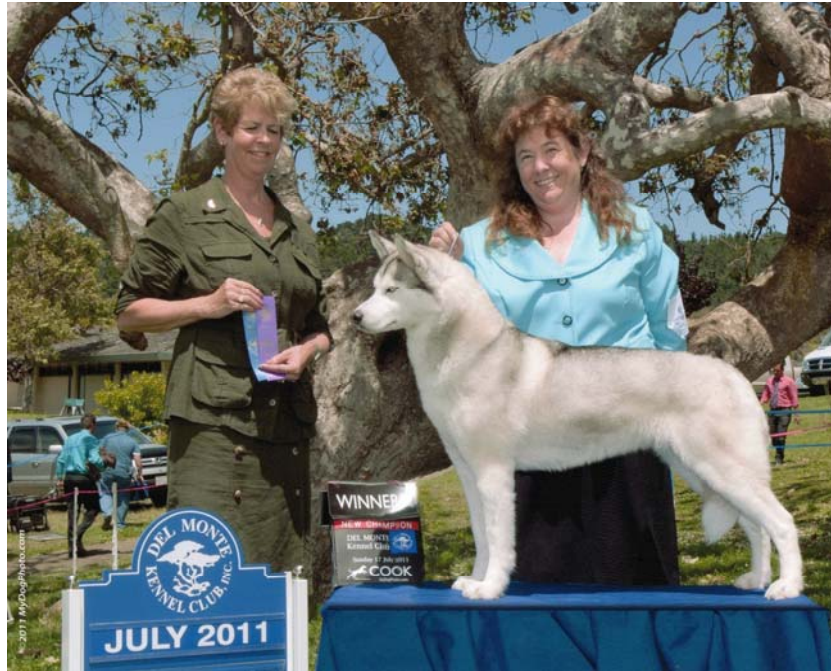
Ch. Melrose And Noatak's Timrjan