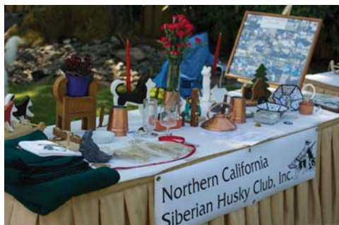
Table displaying trophies, table favors and centerpieces from past specialties