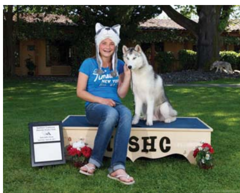
Fun and Games after the Show is over.

*For a complete list of Winners and Win Photos visit our website at www.ncshc.com