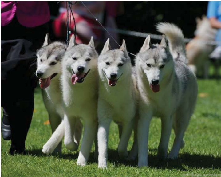
40th Anniversary Show, An amazing team effort considering some of us have trouble getting just one Siberian to go the way we ask!