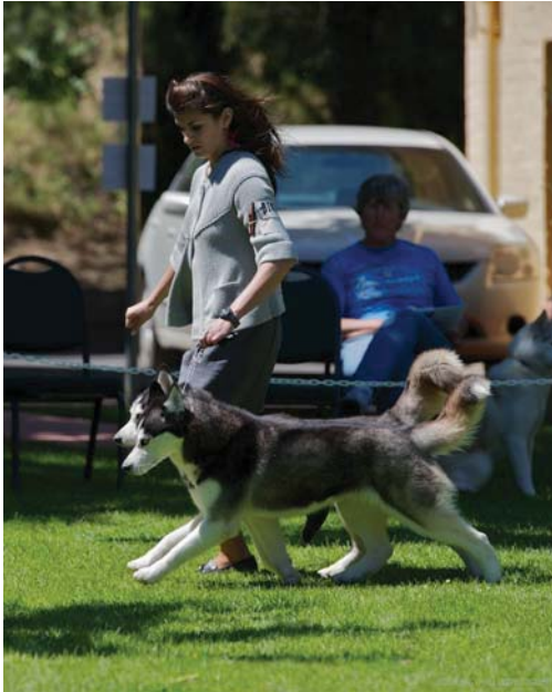
40th Anniversary Show, One of our 4 (that's right 4) wonderful braces!

We unfortunately forgot to ask for brags at the meeting and this was the only brag I received by mail.