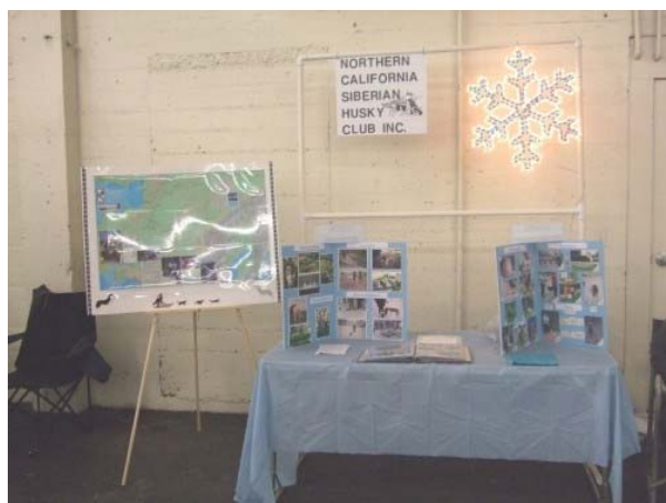
Club information table