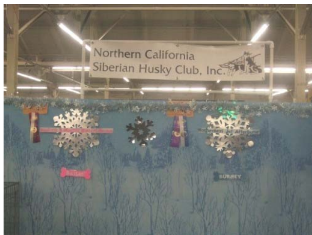
Benching decorations (complete with winners ribbons)