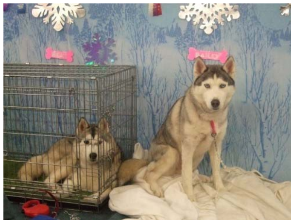
Waiting to meet their adoring public!