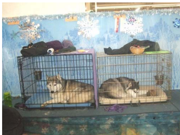
Tired dogs, taking a break.