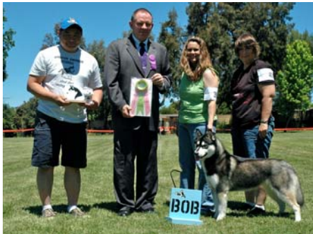
Best of Breed Adult - Nanook's Driven Spirits Wings of Night

The Club would like to thank everyone who made this year's match a success and hope to see everyone at next year's Specialty. Our 40th Anniversary Specialty Show with many special events planned.