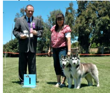
First Place Brace Class - Karnovanda's Dark Side of the Moon/Ch. Karnovanda's Ceilidh