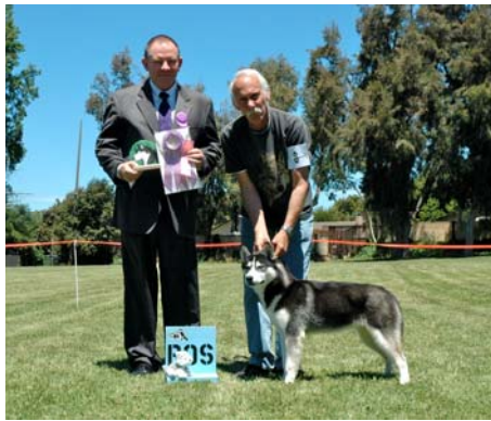
Best of Opposite Sex Puppy - Lycaon Shakeena's Bit Of Koal