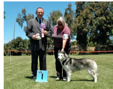
First Place Spay Class - Cyberia's Claddagh Serenade