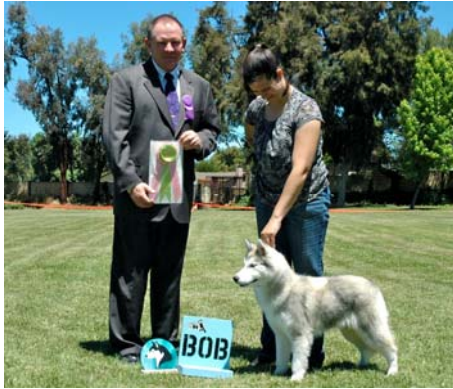
Best In Match Puppy - Melrose After Dark At Couloir