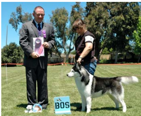
Best of Opposite Sex Adult - Snowycreek's Paint It Black