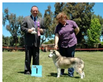
First Place Veteran Bitch Class - Serenade's Silver Legacy