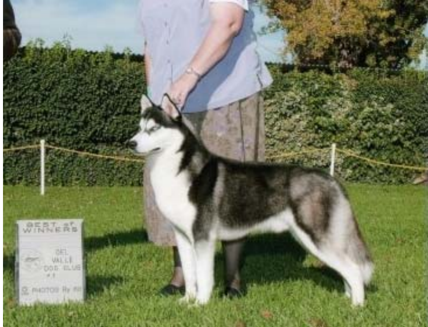
Ch. Serenade's Winter Wizard