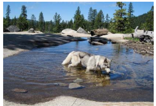
Where did that fish go??