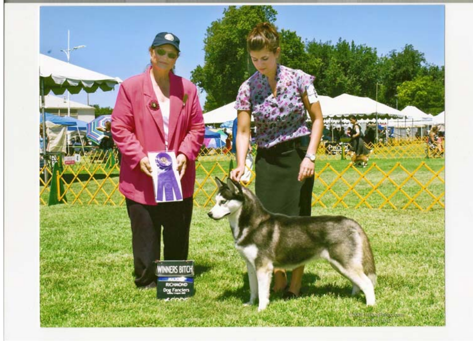
Ch. Trailside's Lil Fashion Statement

Prada is our first home bred Champion. So that was pretty exciting. Since I'm not sure what else to write, I'll tell a story about her....One day we were going on a jog and she always jumps in the bushes when she hears a noise....and out flew a bird and she jumped up and caught it in her mouth.....I was like no way!!!! and then I tried to grab it out of her mouth and she swallowed it whole!!!!!!!!!!!!!!!!!!!!!!!!!!!! so gross!!!!, and she passed her hunting skills on to her daughter Dita....*(she just caught a gopher but didn't eat it). Anyways Prada is a happy camper at home swimming in the kiddie pool.