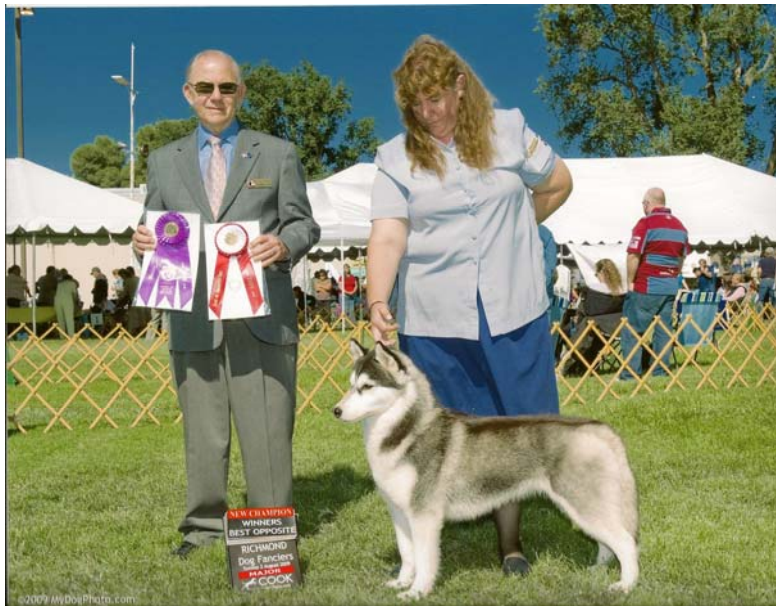
Ch. Karnovanda's Ceilidh